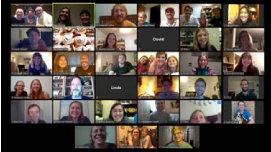
The LuMin Bunch! Screenshots like this one from LuMin's last Sunday worship are becoming all too familiar in this social distancing, pandemic time.