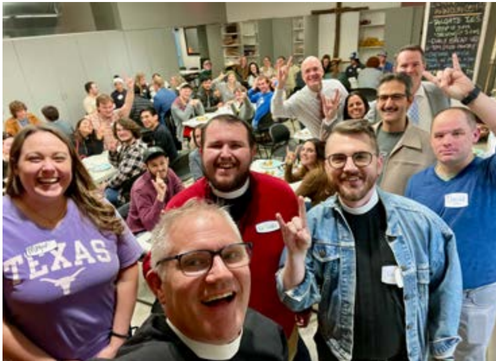
A methodist, a disciple of christ, a latter day saint, an episcopal, a muslim and many, many more walk into a lutheran campus ministry space to get some pie...no joke!