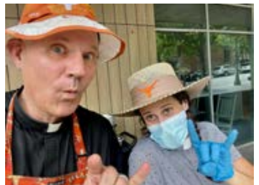
Also unexpected: Getting an Aggie to "Hook 'em!"